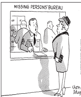
"Is this the same husband who was missing three times last year?"