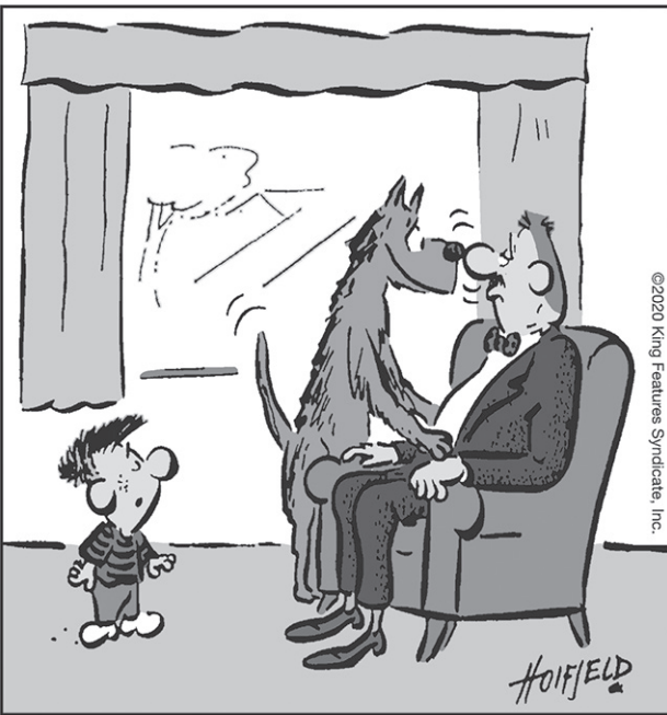
"He's an Eskimo dog."